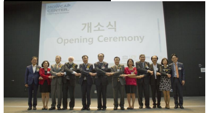
ACC and MOWCAP representatives at the opening

In September a MOWCAP Centre opened in the Republic of Korea. It is the first such Centre for the Memory of the World Programme.