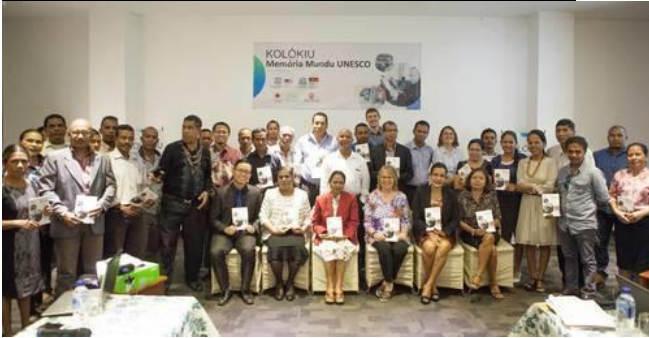
Workshop in Timor Leste

UNESCO and the Government of Malaysia are working together to safeguard documentary heritage with a particular focus on Least Developed Countries (LDCs) and Small Island Developing States (SIDS) in South East Asia