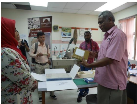
Participants Visit the National Archives of Fiji

UNESCO in partnership with the Korean National Commission for UNESCO, National Archives of Fiji and the Fiji National Commission for UNESCO conducted a workshop in Suva, Fiji. Ten countries were represented at the workshop which focused on preparing nominations for inscription to Memory of the World registers.