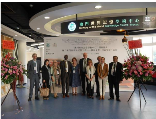
MOWCAP representatives at opening