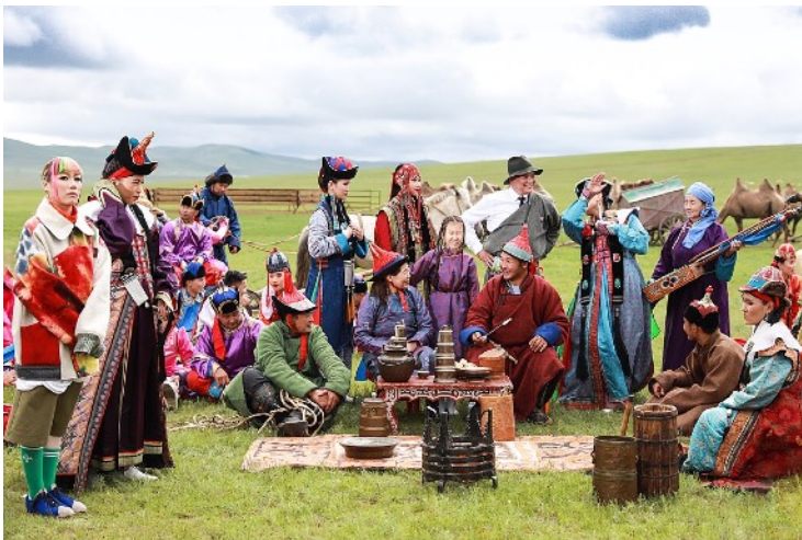
Naadam, a traditional festival celebrated in Mongolia and inscribed on the Representative List of the Intangible Cultural Heritage of Humanity in 2010.

On 8 March 2024, the MOWCAP Secretariat announced that the 10th MOWCAP General Meeting will be hosted by the Ministry of Culture of Mongolia and the Mongolian National Commission for UNESCO , to be held on 6-10 May 2024 at the Best Western Premier Tuushin Hotel in Ulaanbaatar.