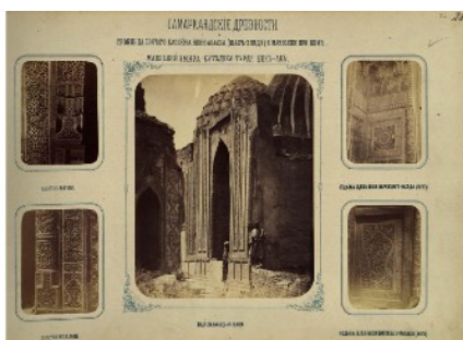
Photographic documentation of archaeological heritage in the “Turkestan Album” 1871-1872, National Library of Uzbekistan