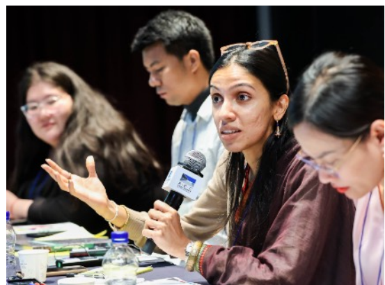
Project beneficiaries discussing results at the ACC-MOWCAP Small Grants Programme Dissemination Seminar on 23 November 2023.