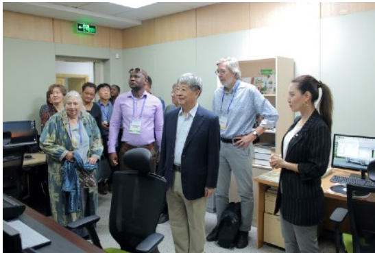
Participants of the MoW International Seminar in Tashkent, Uzbekistan visit the National Library.