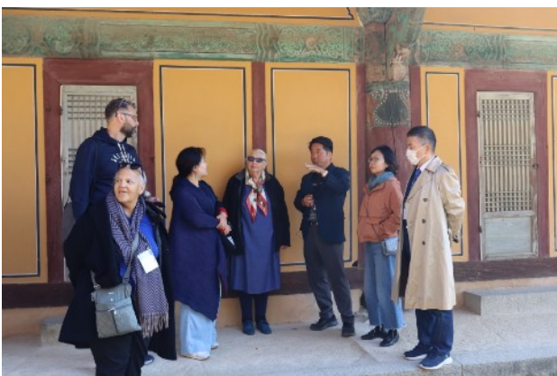
Participants of the MoW Inter-regional conference visit Andong's Bongjeongsa Temple on 28 October 2023.