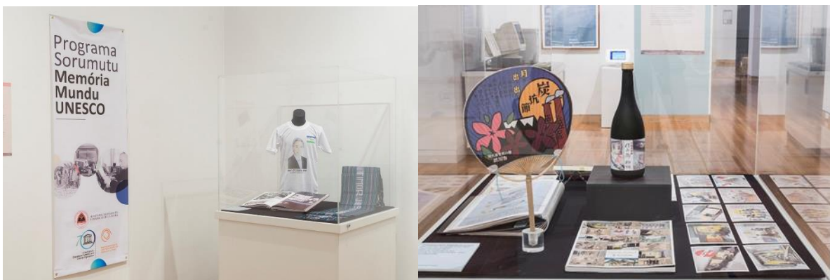
Material relating to MoW workshops in Timor-Leste; Sakubei Yamamoto inscription commemorative material.