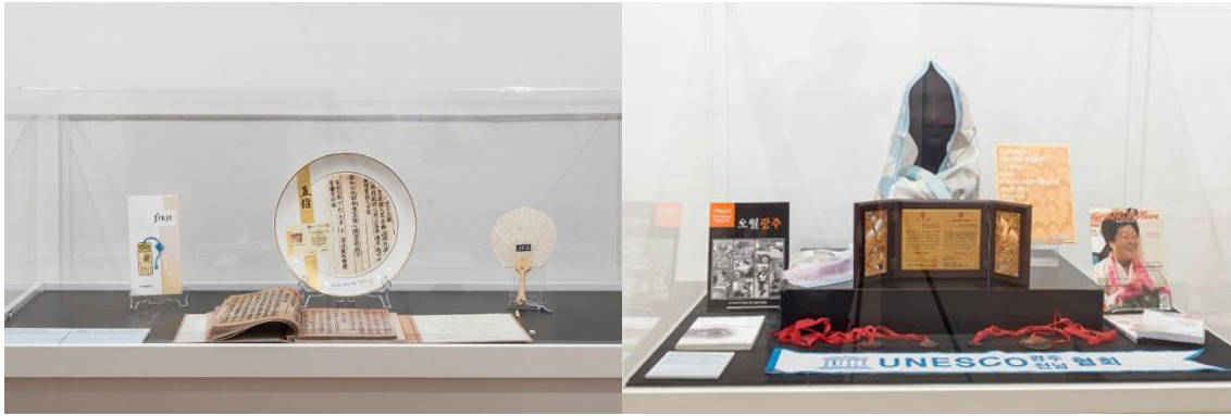
(Left) commemorative items from inaugural presentation of the Jikji Prize, 2005; material relating to Human Rights and Documents symposia in Gwangju, ROK.